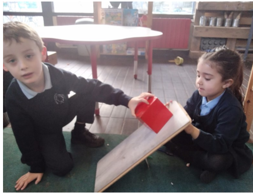
Shape properties Experiment